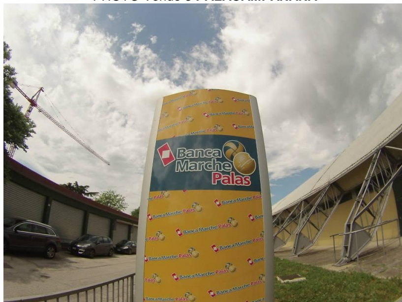
PHOTO Venue 3 PALACAMPANARA