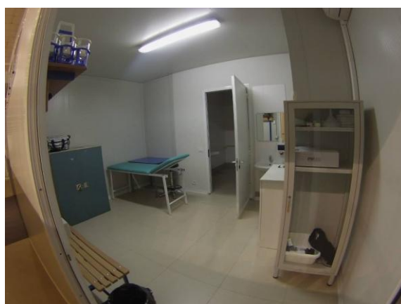
Chance room and Medical + doping control room PALACAMPANARA