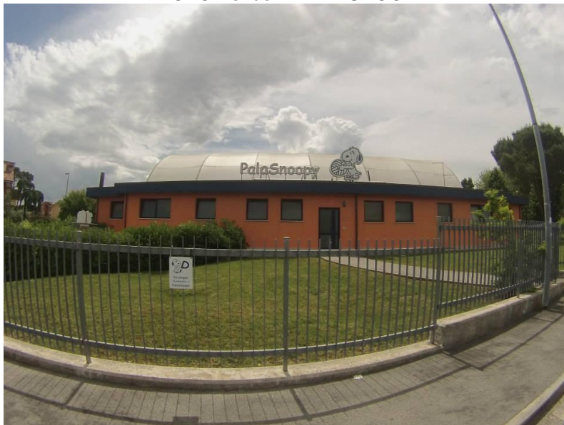
PHOTO Venue 2 PALASNOOPY