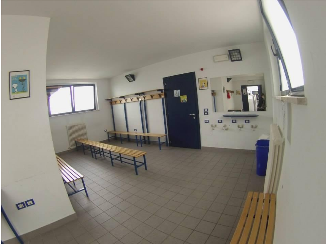
Chance room PALASNOOPY