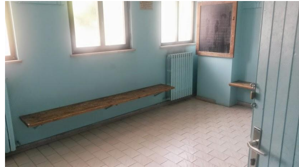
chance room Palasport